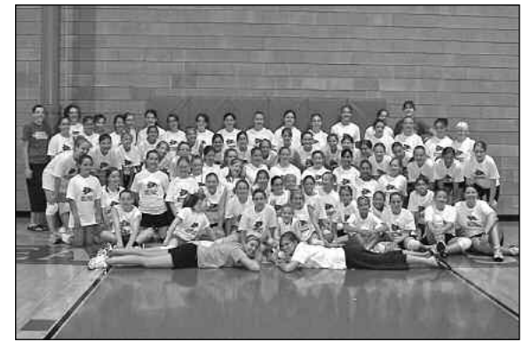
2008 Volleyball Campers